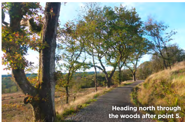
Heading north through the woods after point 5.

▶ Distance: 6½ miles/10.3km ▶ Time: 4 hours ▶ Grade: Moderate