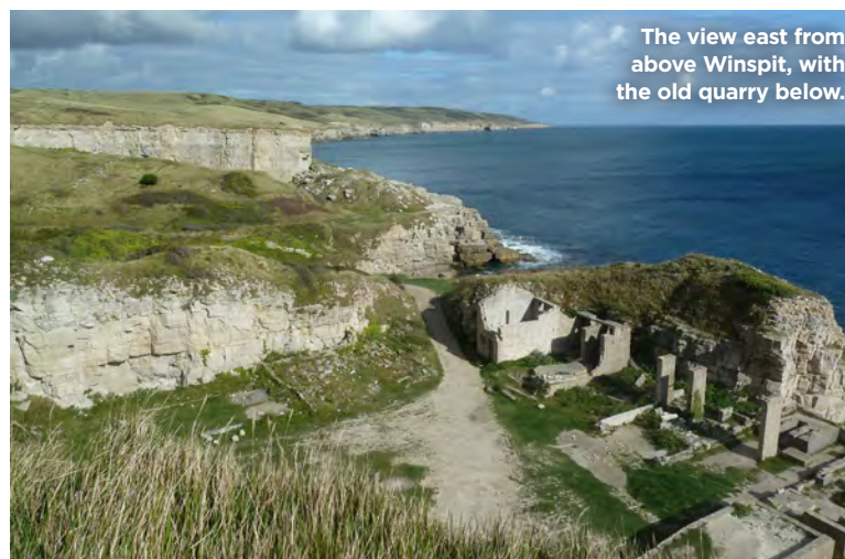
The view east from above Winspit, with the old quarry below.

6 9½ miles/15.1km Turn R along South Street just after Victorian church (for pub carry straight on). Follow lane S, keeping ahead at fork downhill to rejoin CP, turning L. Retrace earlier steps past Hill Bottom cottages, but then stay on lane up to Renscombe Farm and back to start. CW