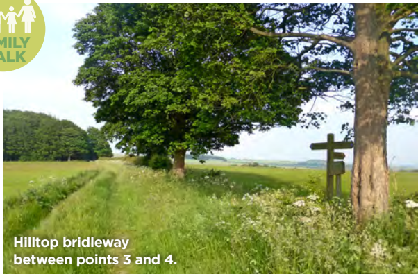
Hilltop bridleway between points 3 and 4.