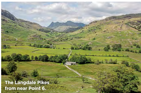
The Langdale Pikes from near Point 6.