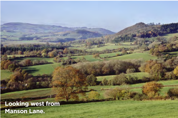
Looking west from Manson Lane.