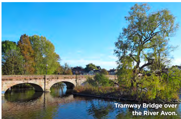
Tramway Bridge over the River Avon.