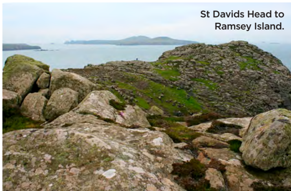
St Davids Head to Ramsey Island.

▶ Distance: 4½ miles/7.2km ▶ Time: 2¾ hours ▶ Grade: Moderate