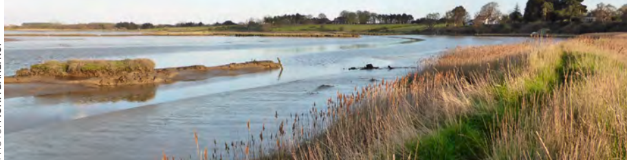
Looking along the River Alde towards Iken Cliff.