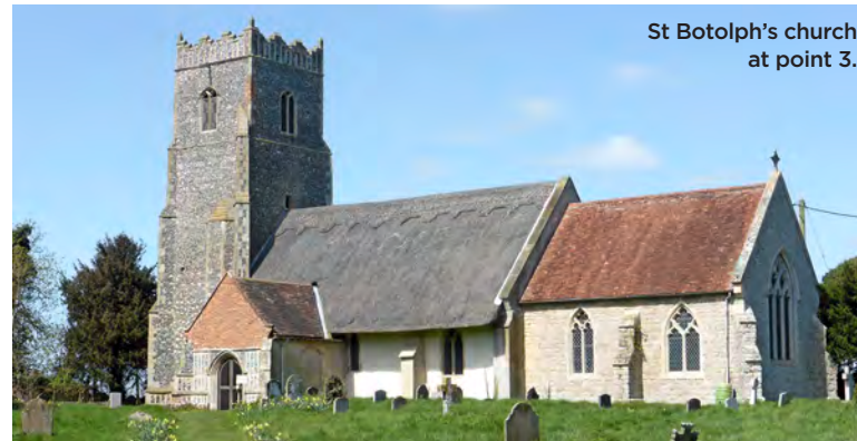
St Botolph's church at point 3.

5 9½ miles/15.25km From here the route leads to Blaxhall Heath/Common. Cross the B1069 and at the next road junction turn R to return to Snape Maltings. CW