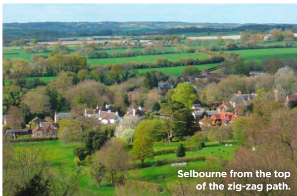
Selborne from the top of the zig-zag path.