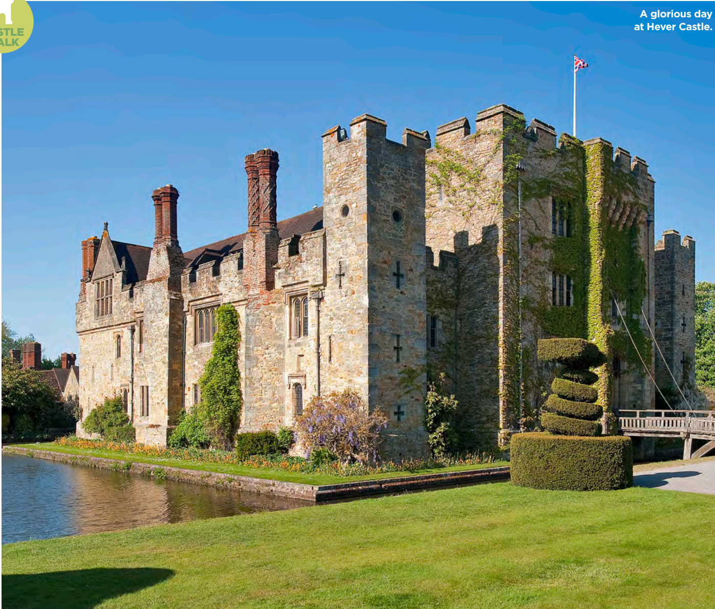
A glorious day at Hever Castle.