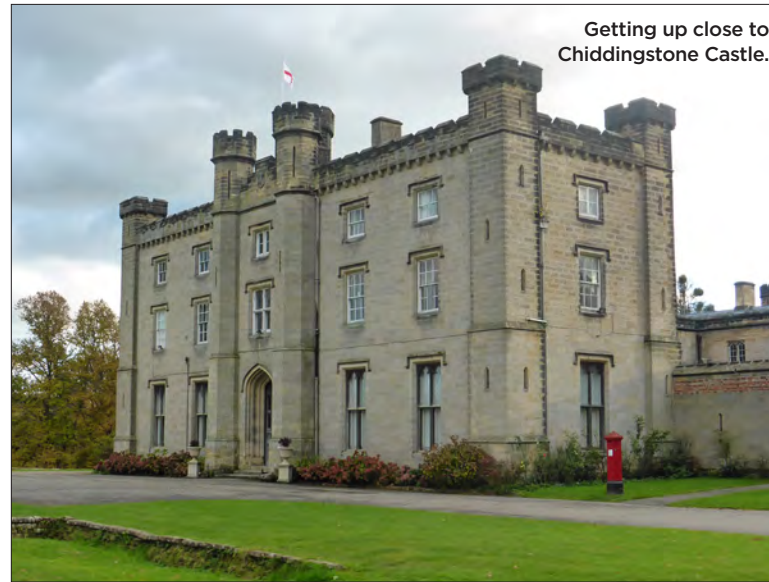
Getting up close to Chiddingstone Castle.