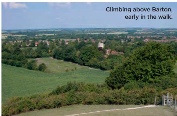
Climbing above Barton, early in the walk.