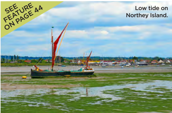
Low tide on Northey Island.