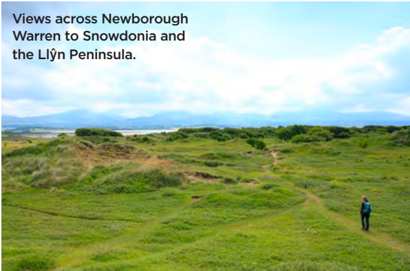
Views across Newborough Warren to Snowdonia and the Llŷn Peninsula.