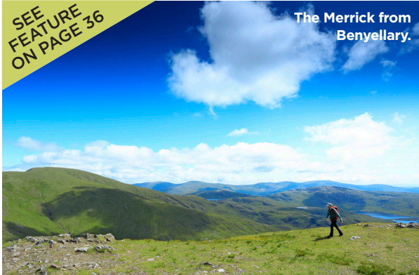
The Merrick from Benyellary.