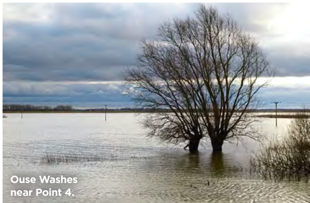
Ouse Washes near Point 4.