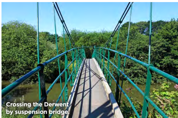
Crossing the Derwent by suspension bridge.