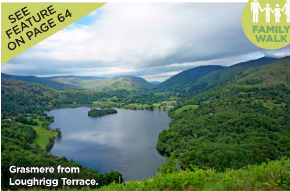
Grasmere from Loughrigg Terrace.