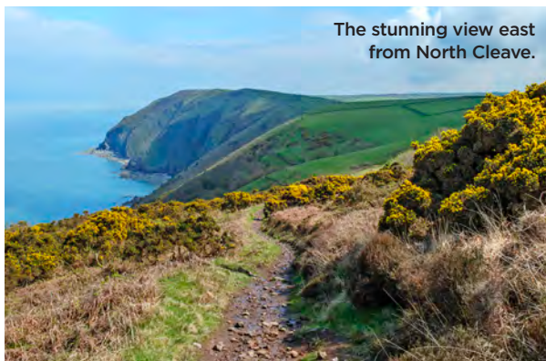
The stunning view east from North Cleave.

▶ Distance: 6 miles/9.7km ▶ Time: 3 hours ▶ Grade: Moderate