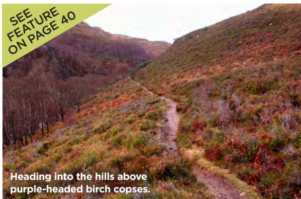
Heading into the hills above purple-headed birch copses.