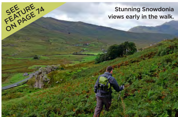
Stunning Snowdonia views early in the walk.