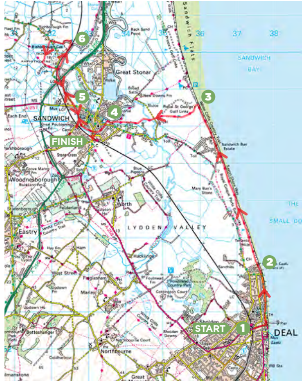
ORDNANCE SURVEY MAPPING ©GROM COPYRIGHT 2016 IN ASSOCIATION WITH MEMORY-MAP/BAUER MEDIAS MEDIA LICENCE NUMBER 042216

6 8 miles/12.8km Turn R to continue on the path around the perimeter (or turn L to the English Heritage visitor