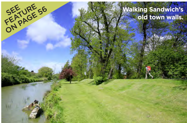
Walking Sandwich's old town walls.