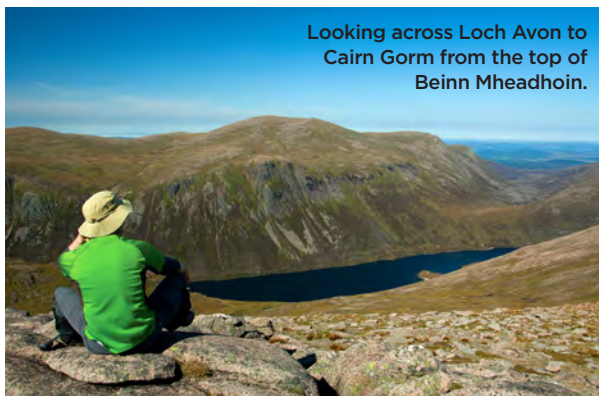
Looking across Loch Avon to Cairn Gorm from the top of Beinn Mheadhoin.