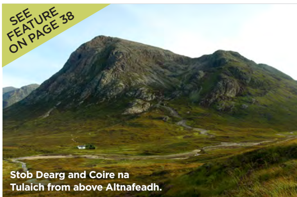
Stob Dearg and Coire na Tulaich from above Altnafeadh.