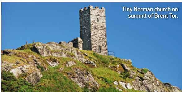
Tiny Norman church on summit of Brent Tor.

climb to path junction. Fork L to South Brentor Farm. Retrace your steps back to starting point. CW