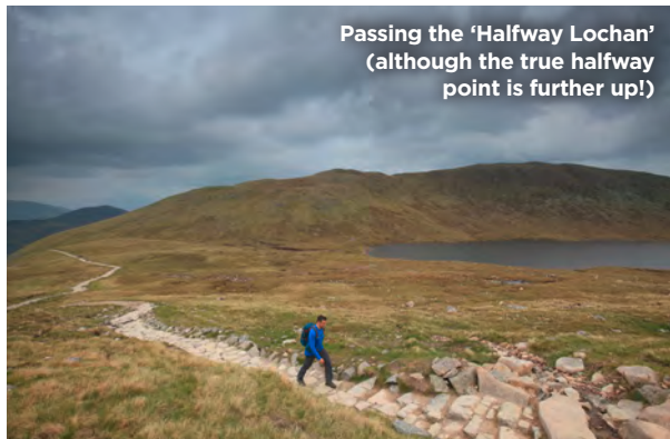
Passing the 'Halfway Lochan' (although the true halfway point is further up!)