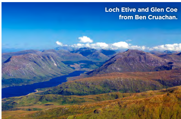
Loch Etive and Glen Coe from Ben Cruachan.